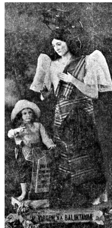
Fig. 1. "Ang Virgen sa Balintawak," courtesy of the Lopez Museum Collection.

The image of the Virgen sa Balintawak (fig. 1) became one of the most popular figures of Aglipayan iconography and religious portraiture that was