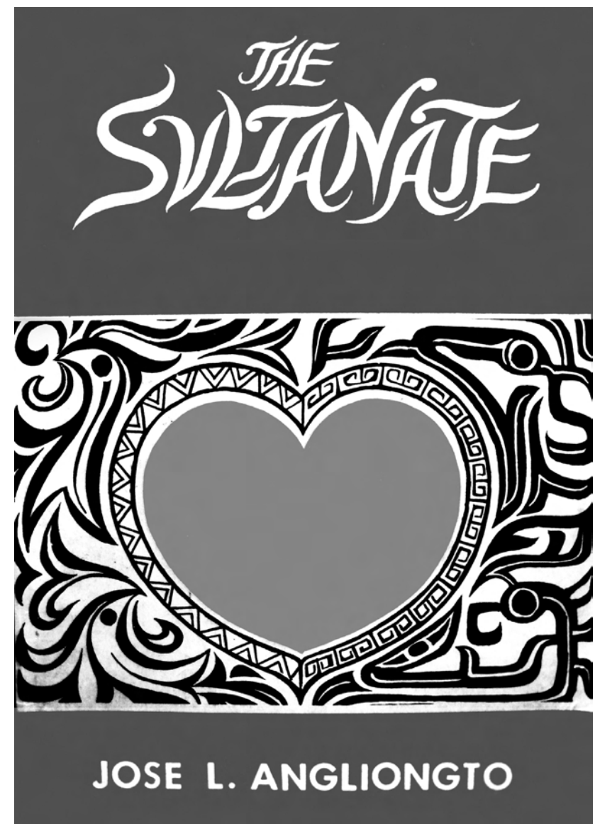
Fig. 1. Cover of Jose L. Angliongto's The Sultanate , designed by Ang Kiukok

Just as important, and in line with the aim of ancient novels (Holzberg 1995, 26–27), The Sultanate sets out to depict certain ideals through a narrative account of the providential experiences of a given character. Just what these ideals are is suggested by the novelistic focus on the travels, adventures,