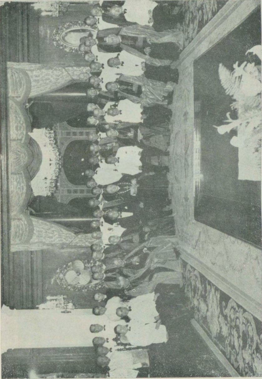
The state banquet at Malacañang Palace. Cardinal Spellman (at the President's right) wears the collar chain of the Order of Sikatuna (highest Philippine decoration) given to him on this occasion.