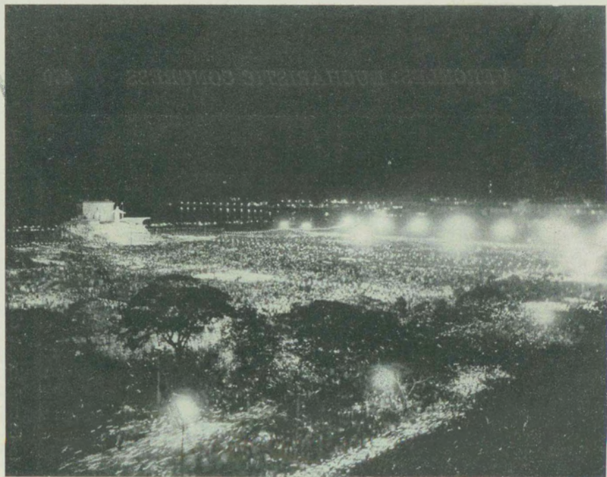
The closing ceremonies. A million people listen to the Pope's address.