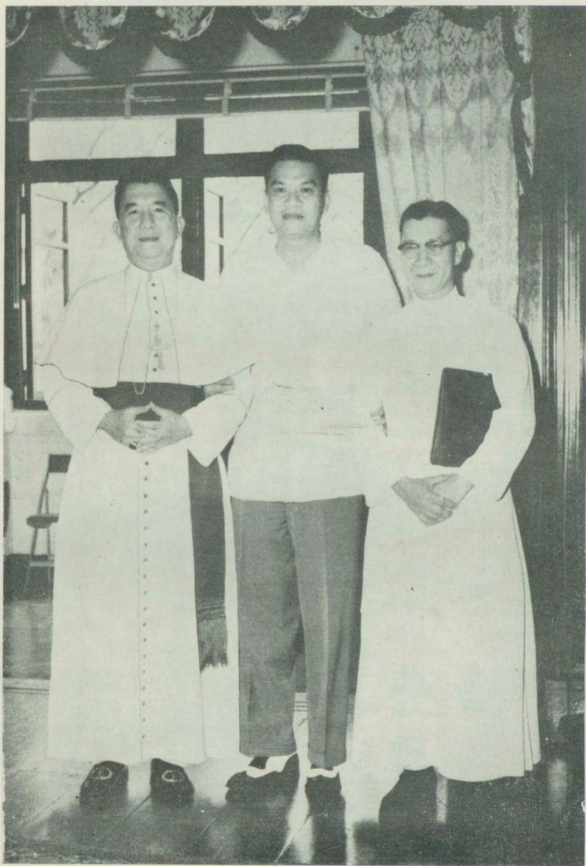
President Magsaysay (honorary chairman) with Archbishop Rosales (national chairman) and the secretary general.