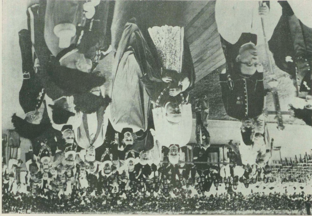
Cardinal Spellman (wearing collar of the Order of Sikatuna) is escorted in solemn procession up the Luneta altar.