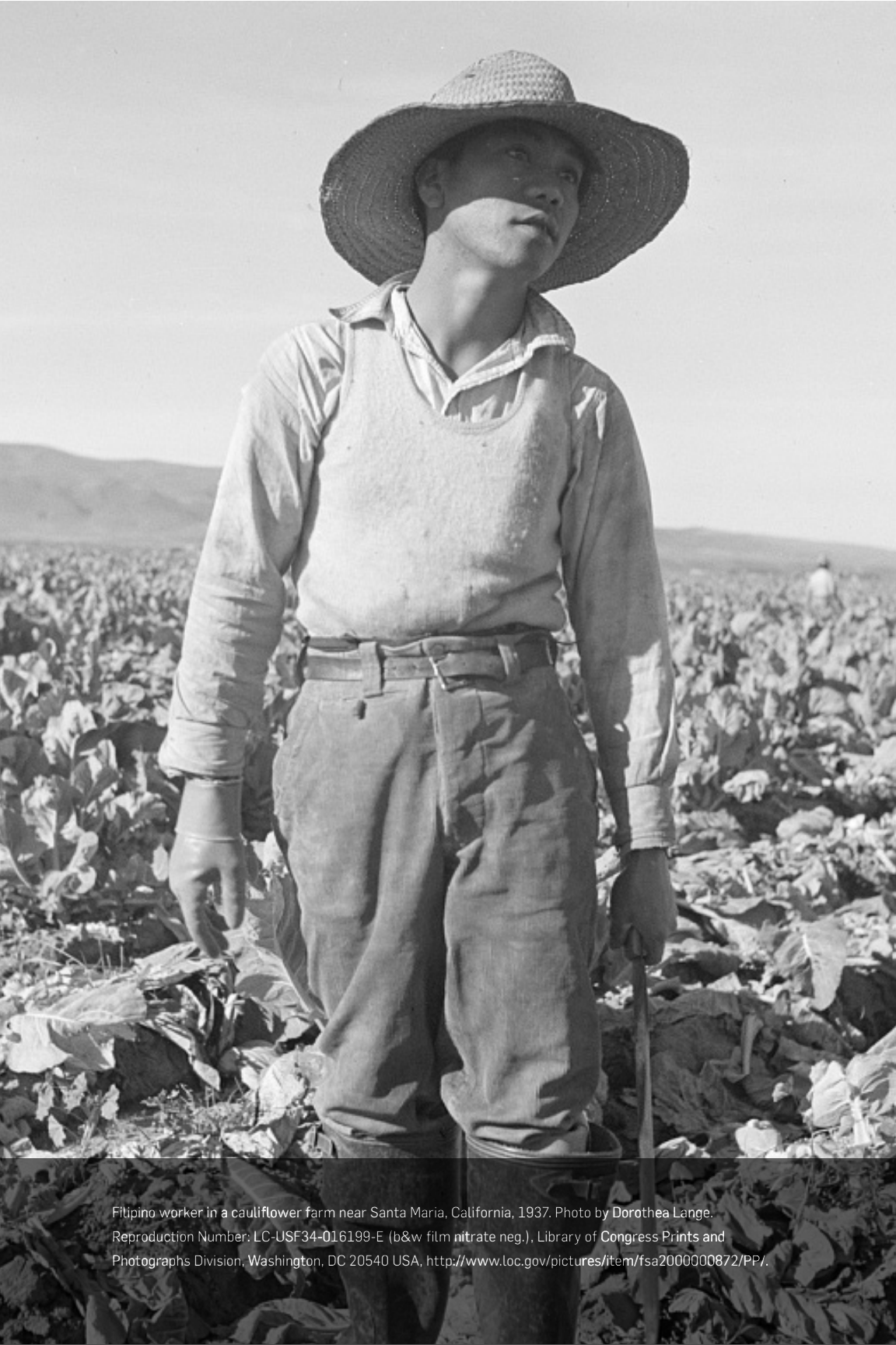
Filipino worker in a cauliflower farm near Santa Maria, California, 1937.