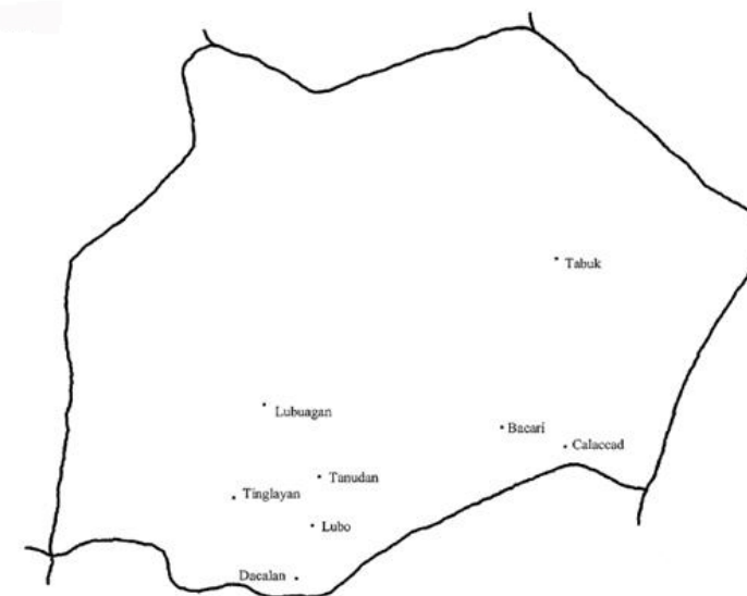
Fig. 2. Map of Kalinga

attacked PC soldiers and raided pony pack-trains that brought supplies to American officials in Kalinga (Harris 1911, 1).