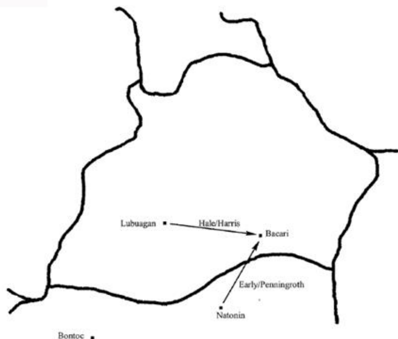
Fig. 4. Battle strategy map

From 11 January until the morning of 14 January the plan worked to perfection. Both groups followed the routes prescribed by Pack, picking up stray weapons from Kalinga villages along the way. But on the appointed rendezvous day things began to fall apart. Some of the problems were logistical but most of them were due to philosophical differences and a clash of personalities.