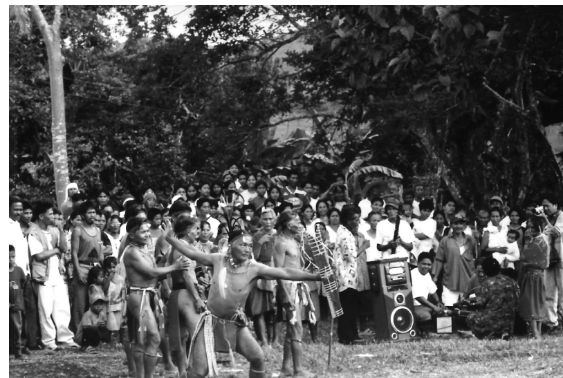
Fig. 4. Ilongot men posing as headhunters during the fiftieth anniversary celebration of the coming of the Gospel to the Ilongot people, 2004. The Ilongot have stubbornly refused to enact their headhunting past for the government, but they are willing to do so in the context of celebrations in the church.

NPA killings not only stimulated the resurgence of headhunting among the Bugkalot and provided new justification for it, it also changed the Bugkalot's relationship with the government and led to their greater dependency on the state. Before the NPA violence, the Bugkalot were always in an oppositional relationship with the military due to their headhunting incursions to the lowland, and perceived the state to be an intrusive force. The threat of NPA violence motivated them to join the CAFGU and cooperate with the military, further incorporating them into the state. After the death of Sakdal, the first barangay captain of New Gumiad appointed by the government, an unprecedented local election for barangay captain and