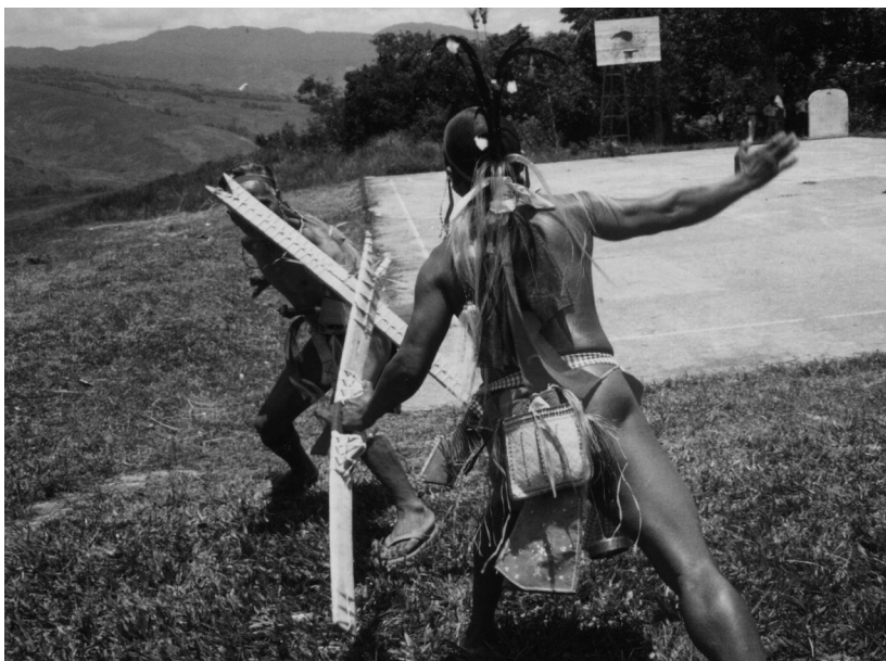
Fig. 5. Ilongot men posing as headhunters, 2004.

of headhunting for shaping their collective identity and the politics of the present. In the early 1990s, when the government started the planning of a predatory development project in the Bugkalot territory, the construction of the Casecnan Dam and Diduyon Dam, which would have required a large-scale resettlement of the Bugkalot to the lowland, the Bugkalot threatened to resort to headhunting as a means of resistance (Salgado 1994). Due to their strong protest, the project was downsized and no resettlement policy was enforced (Valencia 1998). The Bugkalot do not develop headhunting scares or ideas about construction sacrifice as a critique of the loss of political autonomy (Barnes 1993; Drake 1989; Erb 1991; Forth 1991; Hoskins 1996b; Pannel 1992); instead they turn headhunting into a means of empowerment against state domination.