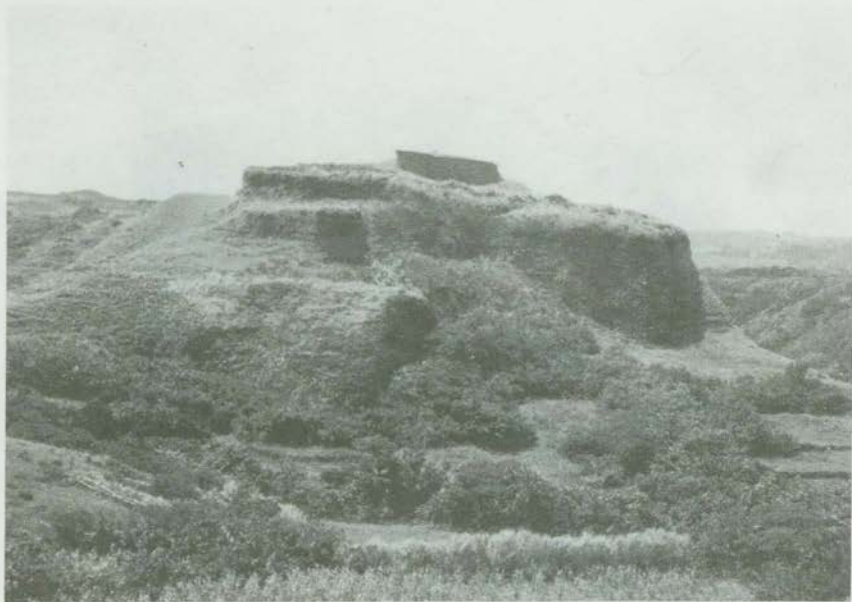
This natural rock formation called ijang , was used by pre-hispanic Ivatans as a refuge and fortress. Almost every barrio and town has an ijang . It is believed that such places and their surroundings are occasionally haunted by the añitus of tribal ancestors.