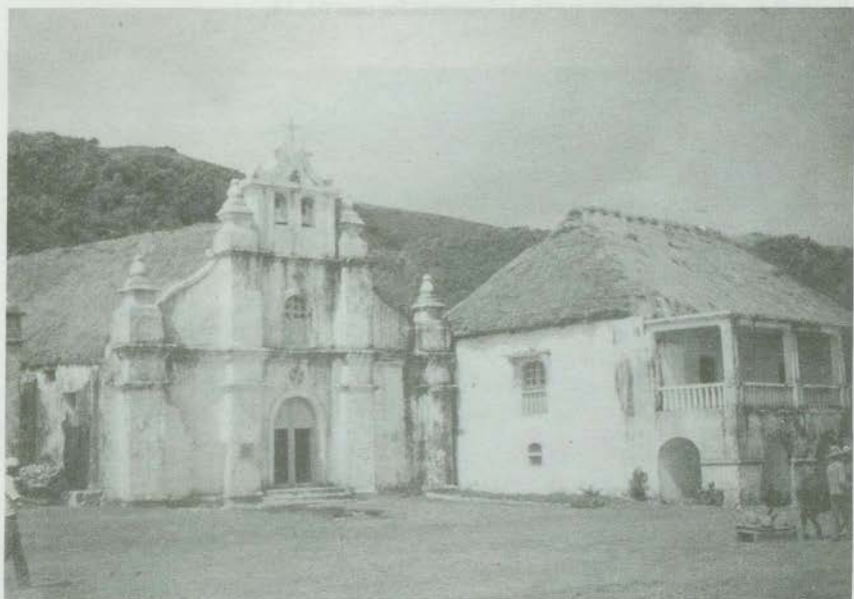
The church of San Vicente Ferrer in Sabtang. A communal coffin kept in the store room of this church is believed to move around by itself (under añitu influence) at night. As a result people fear to be in church alone after dark.